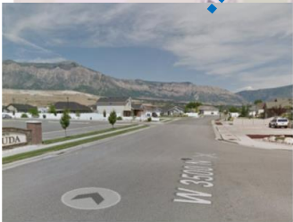
3500 N. 2575 W. Looking east.