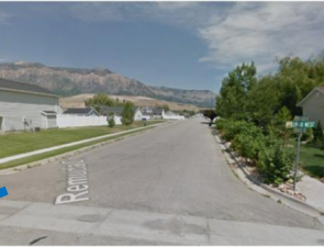
3850 N. 2800 W. looking east.